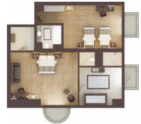
Deluxe Superior Family Room