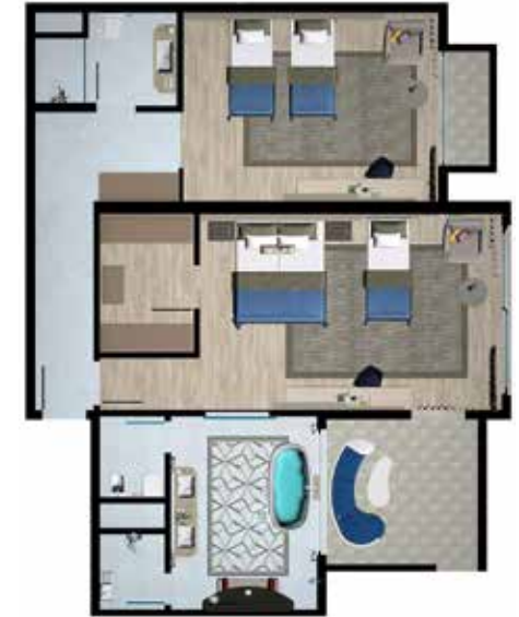
Deluxe Pool Family Room