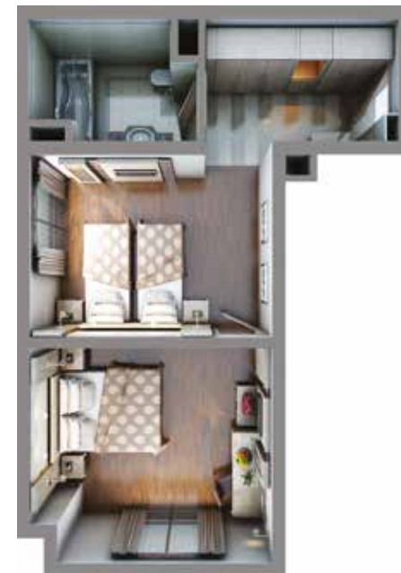
Deluxe Family Room