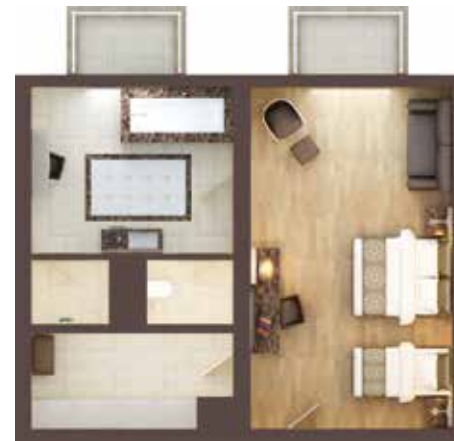
Deluxe Superior Room