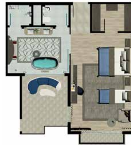
Deluxe Pool Room